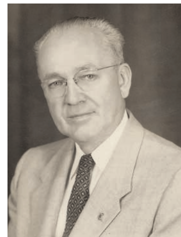
Clinton T. Duffy