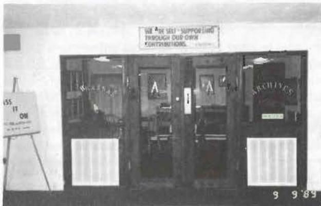
Arkansas State Archives, Little Rock