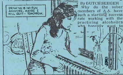
This panel is from 'Too Young?', a comic pamphlet published by Alcoholics Anonymous.

wives who stayed home and no one knew they were going into town.