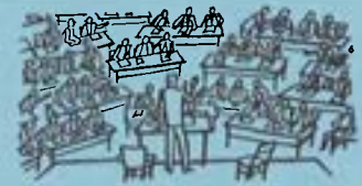
WHY THE GENERAL SERVICE CONFERENCE

OVERSEAS NEWS "The A.A. literature has to reach the alcoholic in his own language." "The Twelve Step stress that we need to carry this message to alcoholics. Many of us regard this as a mandate and I do not know of any geographical limitations on this obligation." "I am extremely grateful that the fellow in Alaska 10 years ago didn't keep what they had found to themselves. I think you should be, too, because if they had, a lot of the alcoholics we