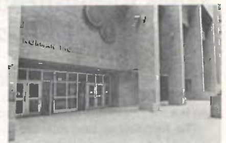
On November 13 (see article at right), this New York City school will open its doors to A.A. members visiting G.S.O., a block away.

All the foregoing experiences make it clear that many A.A.'s continue to respond to the needs of the still-suffering alcoholic, meeting the demands of the times and carrying the message in new ways as well as old. If a decline in traditional twelfth-stepping has been perceived as a problem in your area, perhaps local members have developed still other approaches, and we hope you will share them.