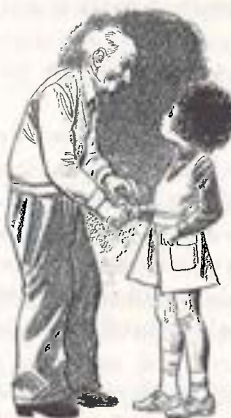
As this sketch from the pamphlet "Too Young?" indicates, an alcoholic can't be "too old" to find a gratifying recovery in Alcoholics Anonymous.

"Special groups of any kind do share that one requirement for membership—a desire to stop drinking. If a special group can make it easier to break through the wall of denial and come upon surrender and acceptance, it is filling a purpose."